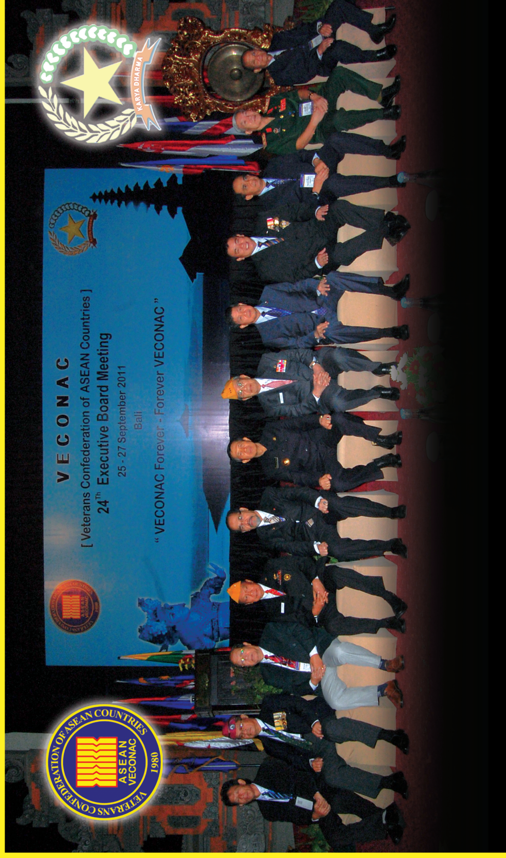
GOVERNOR OF BALI WITH THE 24 TH VECONAC EXECUTIVE BOARD MEETING HEAD OF DELEGATE